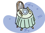
TABLE SETTING (County Only)